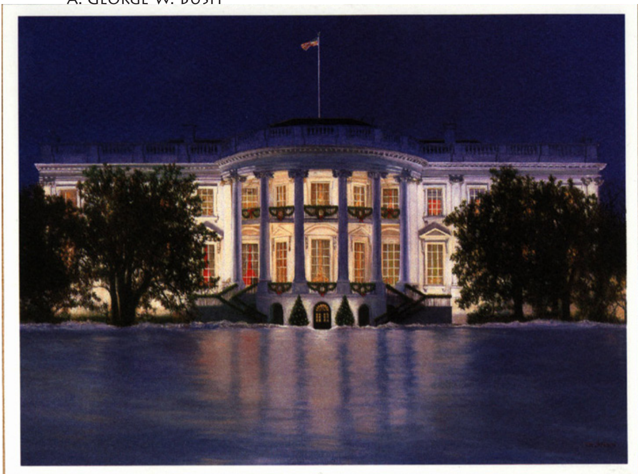
The 1997 White House Holiday Card is a reproduction of Kay Jackson's "White House Nocturne, South Lawn 1997." It features a view of the South Lawn on a winter's evening.

HTTP://WWW.FACEBOOK.COM/PAGES/KRAKOW-POLAND/ZOOM-IN-ON-AMERICA/55275357401