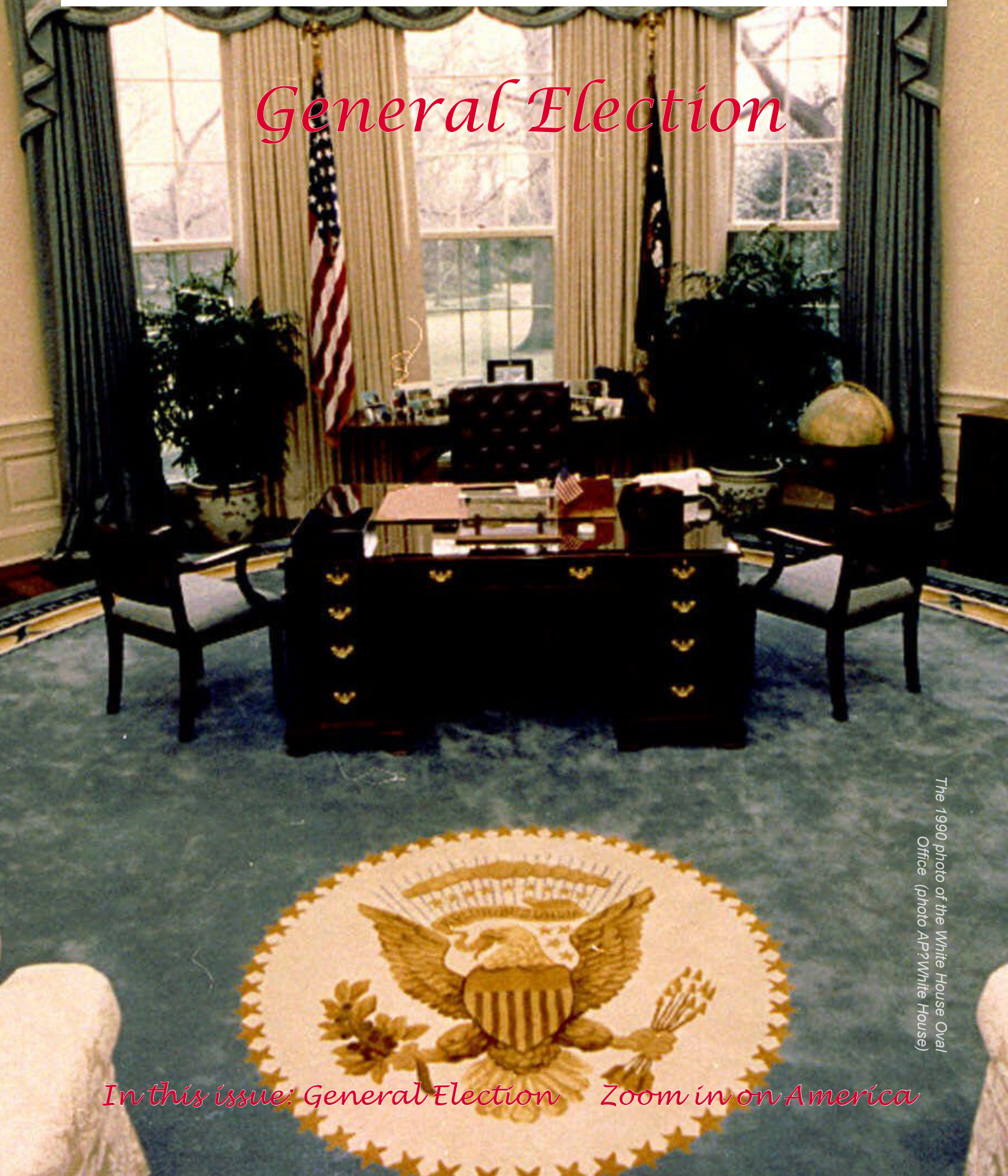
The 1990 photo of the White House Oval Office

In this issue: General Election Zoom in on America